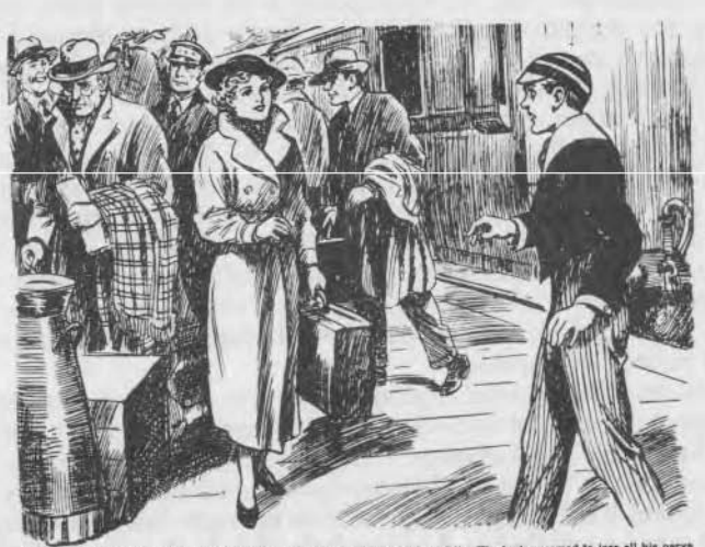
"Serial" assistanced Tailton in establishment. "What are you doing here ?" The junior seemed to take all its sight of that from pretty face, with the clear bise eyes that had a monthing light in their depths. "The Toff ("also givernoired."